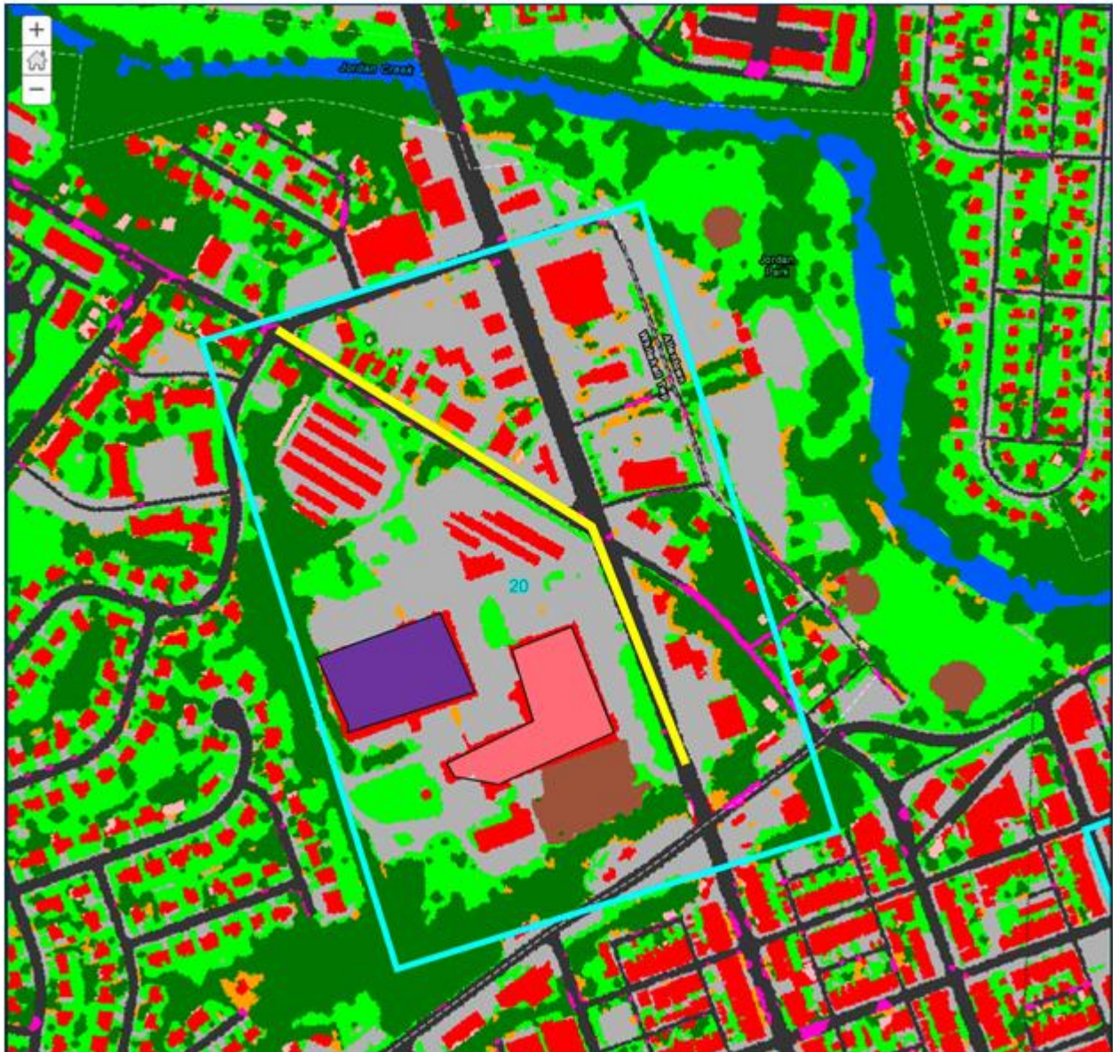
Figure 3. Sample student product from the Urban Heat Island investigation. To reduce the UHI effect in the assigned zone, this student has added a green roof with a garden (purple), white roof instead of a black roof (pink), and changed street to light asphalt (yellow).

After discussing the existing land cover and possible mitigation strategies, students propose several changes for their assigned neighborhood. For example, students suggested converting dark rooftops to light-colored rooftops, creating shade by adding rows of trees within parking lots, modifying large commercial structures to incorporate green roofs, and other recommendations that increase reflection and decrease solar energy absorption by a surface. Students then use the suite of draw tools to make these changes on their ArcGIS.com map and submit their recommendation to their teacher (see example in Figure 3).