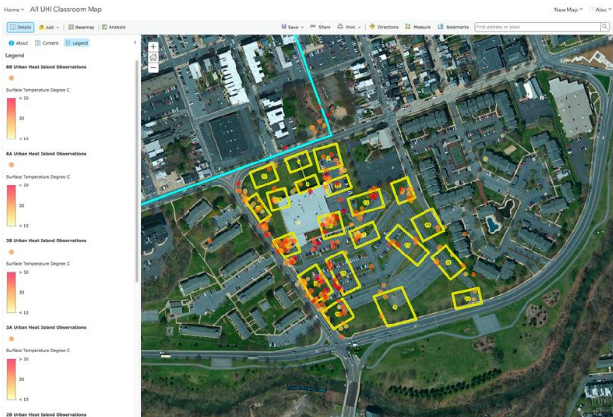
Figure 1. Data collected during the UHI investigation. Colored data points display surface temperature.

on the western edge of the data collection area (yellow and light orange colors), versus the hotter temperatures recorded in the middle of the parking lot (red and dark orange colors).